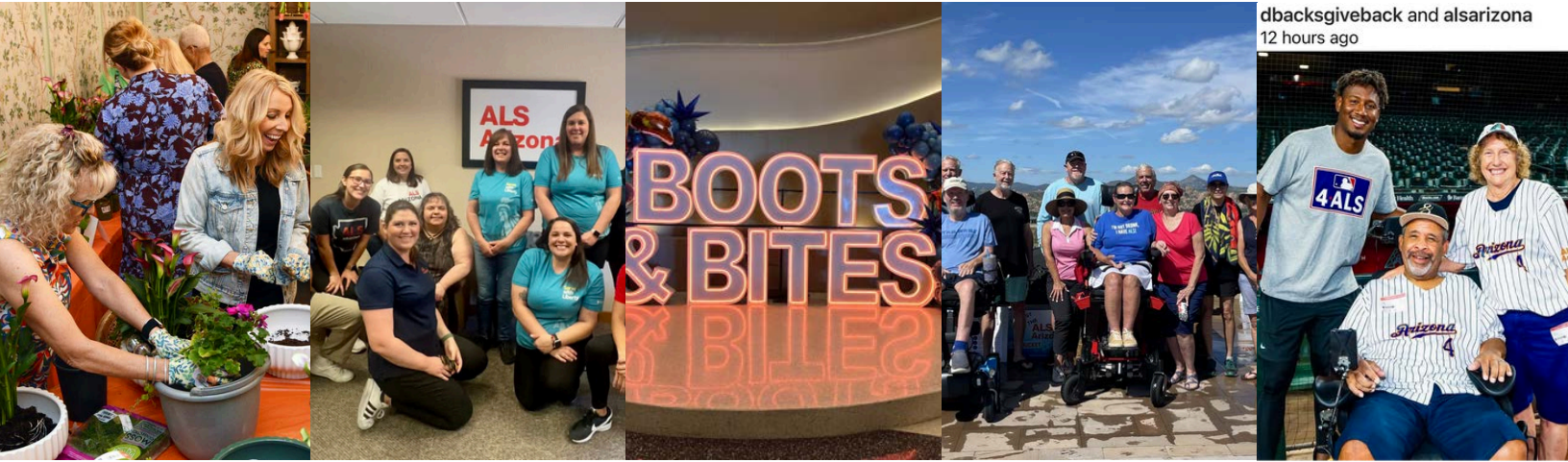
dbacksgiveback and alsarizona 12 hours ago