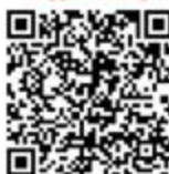
Statewide pALS Support Group