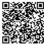
Statewide Caregiver Support Group

Persons with ALS - Monday, February 26th, 1-3 Topic: Mindfulness and Mental Health Held at Starting Point Church- 3106 Gateway Blvd Prescott, AZ 86303