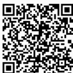
Statewide pALS Support Group

Scan QR Codes below to join or Statewide Virtual pALS and cALS Support Groups! (please note you must download Zoom before scanning the QR codes)